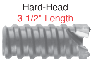
Hard-Head 3 1/2" Length