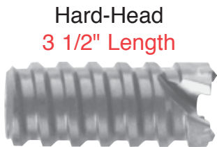
Hard-Head 3 1/2" Length

Slide the taper end of the shank into the "Hard-Head" bit. A slight twisting motion will help keep the bit from falling off before beginning the cut. The pilot is integrated on the shank, so drilling can be accomplished without interruption! Once used, shank and head become one piece.